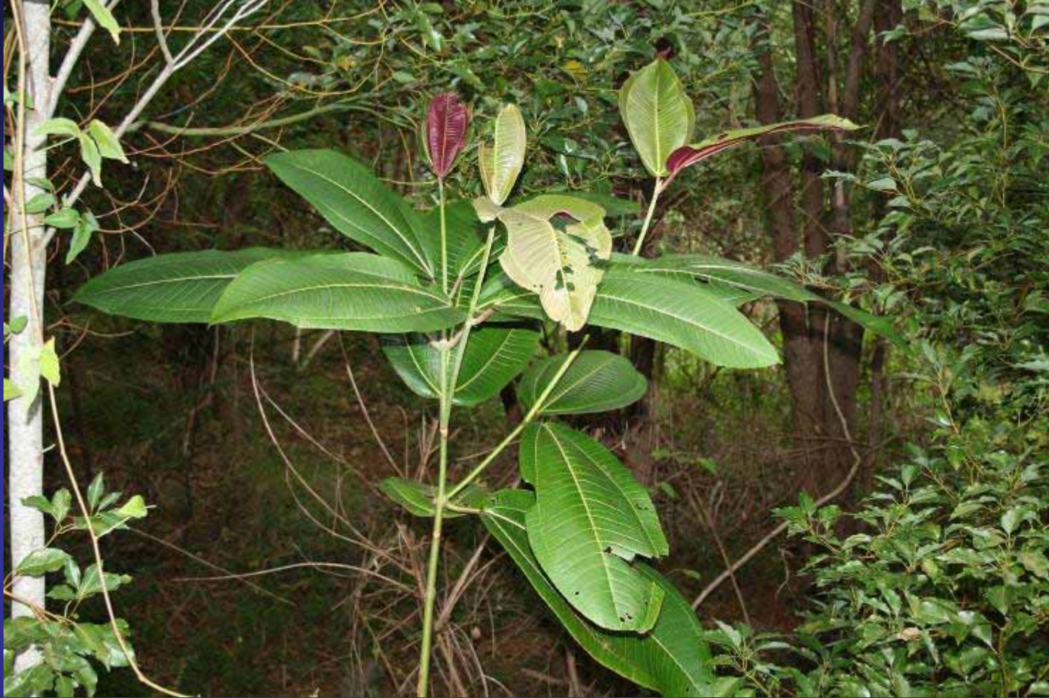
Miconia calvenscens – Miconia